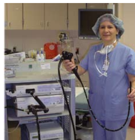
The Olympus brand endoscopy equipment that features HDTV and narrow-band imaging.